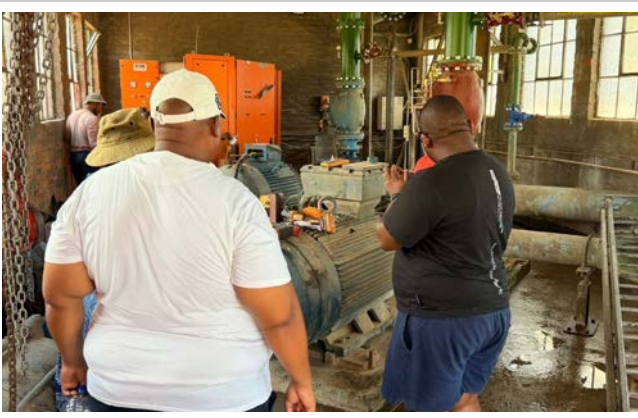
Facility Infrastructure Assessment