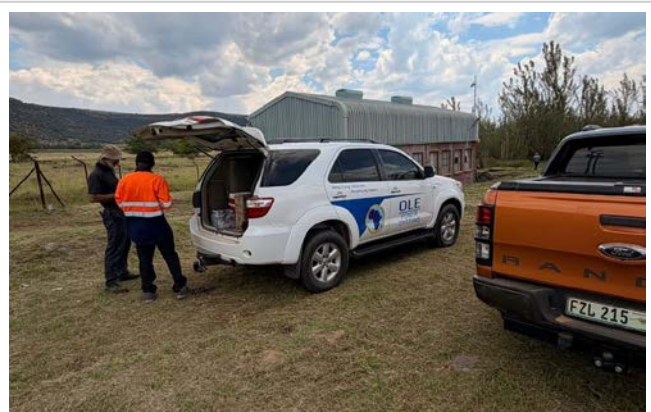
Exterior Logistics & Supply