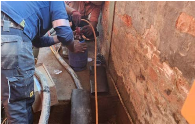
Technical System Inspection