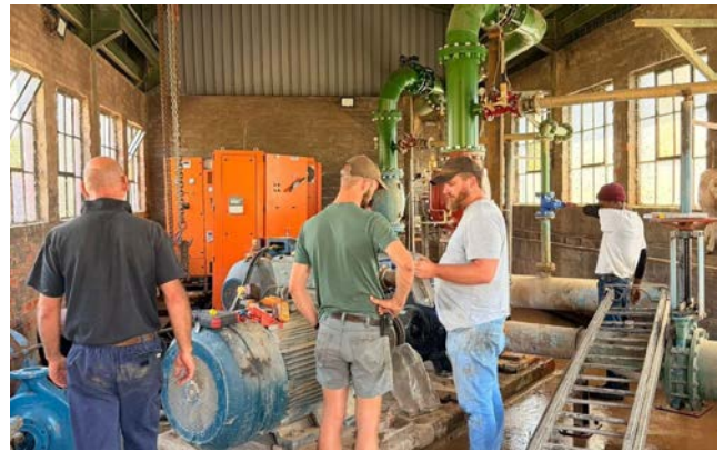
Site Management Team