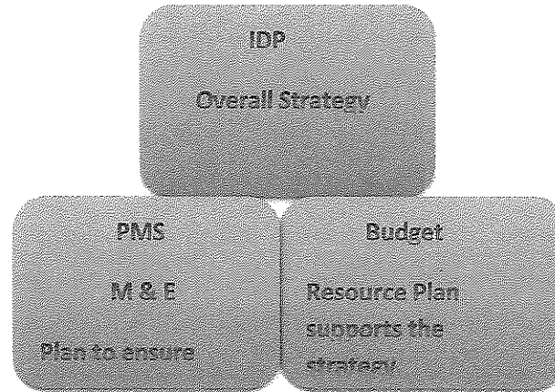
Fig 1: The linkages between IDP, Budget and PMS